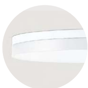
W Snow White