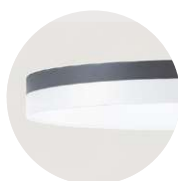
U Urban Graphite