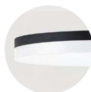
B Jet Black