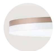
K Satin Copper