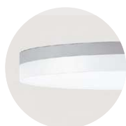
S Radiant Silver