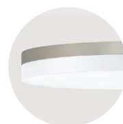
H Anodic Champagne